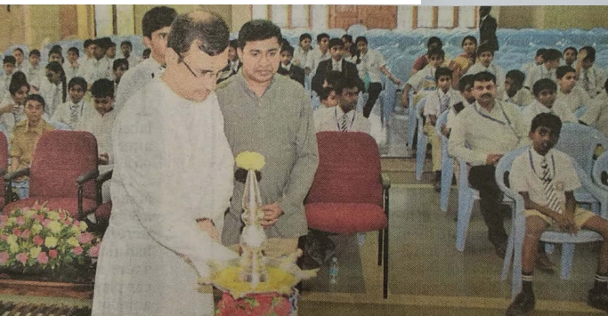
15th July 2019 Deccan Herald