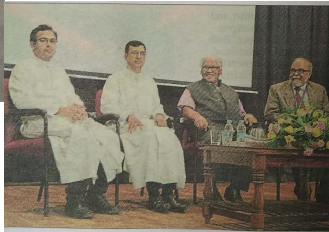
15th July 2019 The Times of India

ST JOSEPH'S BOYS HIGH SCHOOL, MUSEUM ROAD The 3rd edition of the schools' Science and Technology Fest - TRANSCENDENCE 2019 was held recently. The fest witnessed 1,300 participants across 16 events. Bharat Ratna awardee Professor CNR Rao was the chief guest for the opening ceremony. He inspired all the participants into the pursuit of Science.