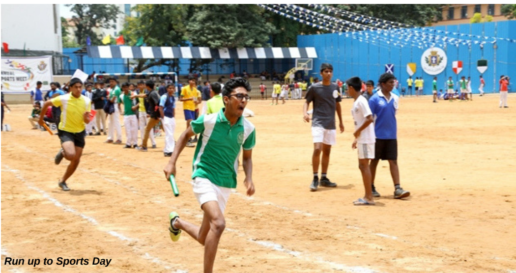
Run up to Sports Day

At the end of the month the most awaited and exciting event, the Annual Sports Day will be held which gives an opportunity for students to display their self-confidence, patience, zeal and sportsmanship.