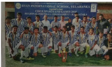
GEARING UP FOR NEXT CHALLENGE