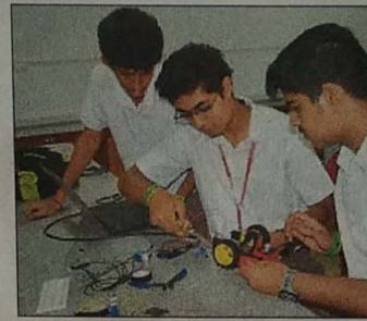
BRAINS AT WORK

Rao also reminisced fondly his interaction with Nobel laureate